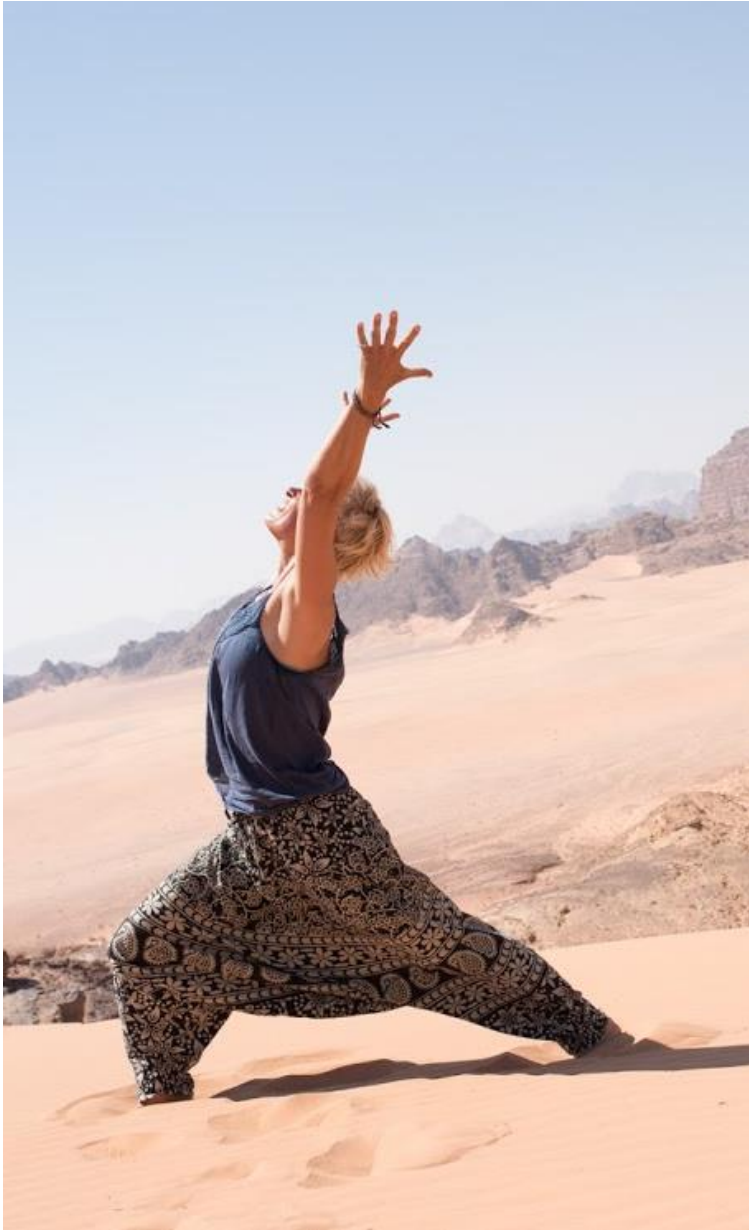
High Lunge on a sand dune in Wadi Rum, Jordan.

The INVESTMENT for this full board desert journey including all mentioned activities: 999 JOD p.p. till July 31st, there-after 1.099 JOD p.p.