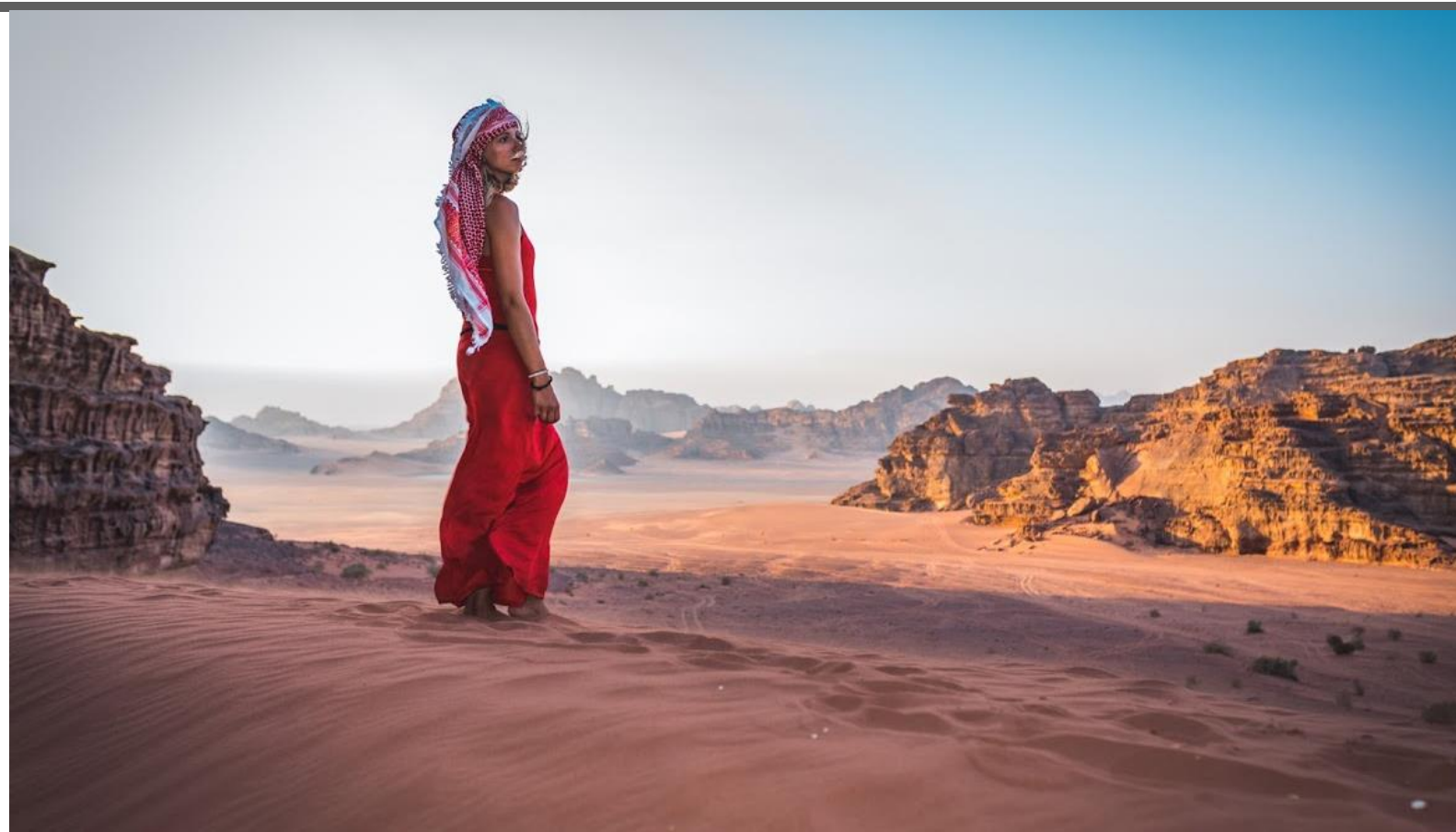
Wadi Rum desert Jordan - Valley of the Moon.

We initiate the day with a yoga session. After breakfast buffet transfer at the