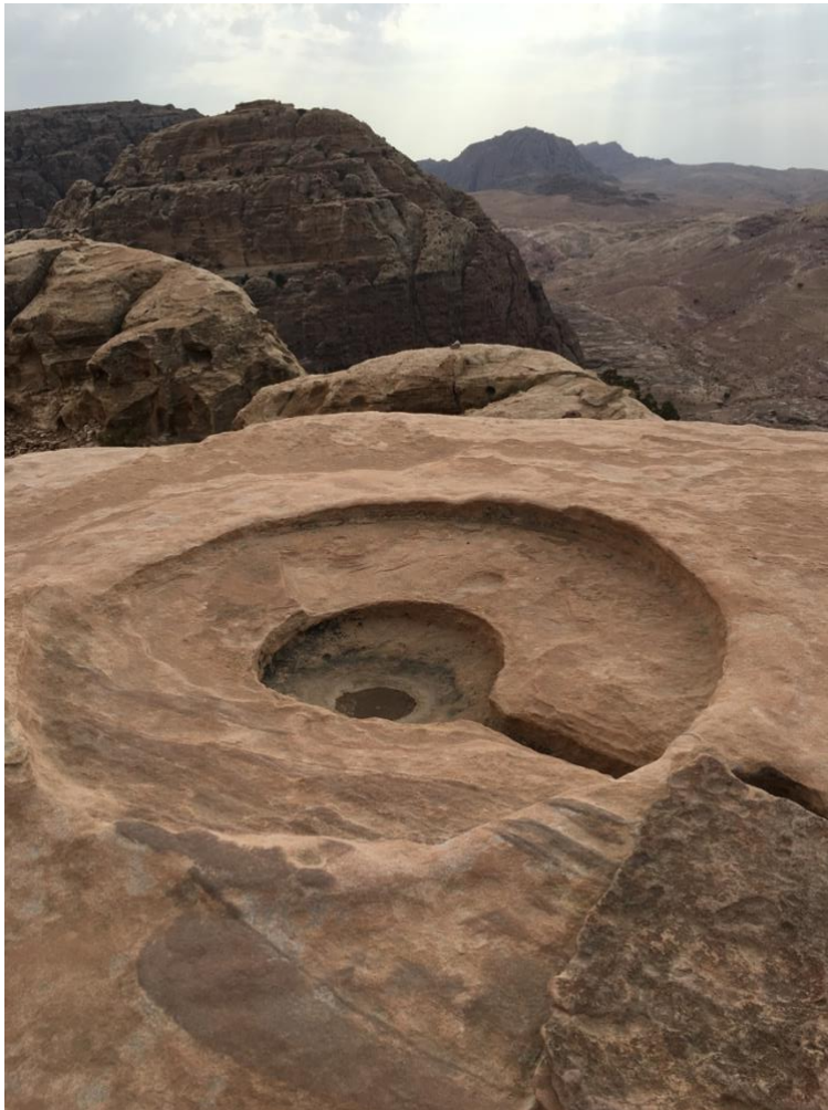
High Place of Sacrifice, Petra, Jordan.